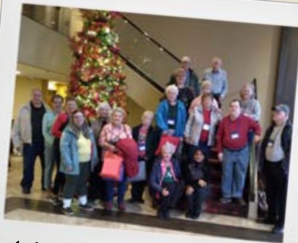
Memory Makers in Branson

Just for the day in July we will go to Lyceum Theatre to see Rogers and Hammerstein's, "State Fair". This trip includes lunch at the historic tavern and an afternoon show. The cost is $95 per person.